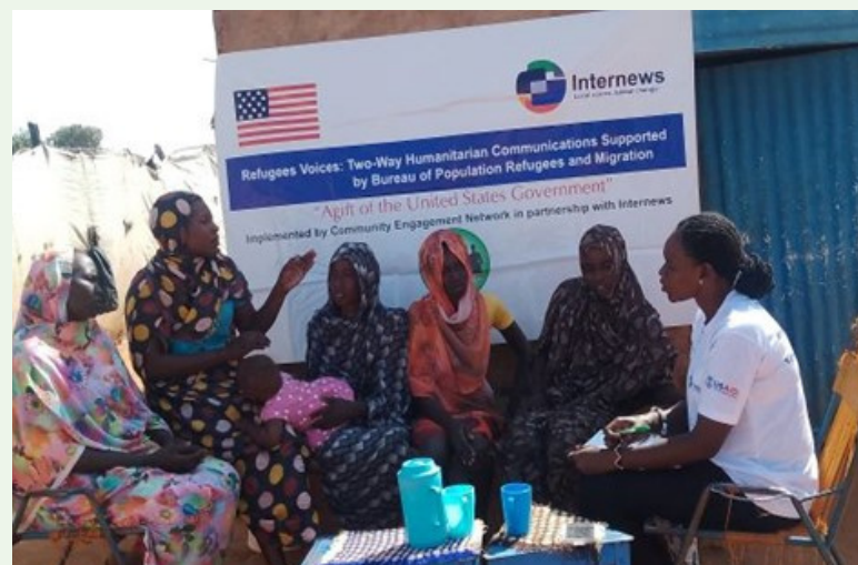
PHOTO: A Community Correspondence conducting a listening group Meeting.

Refugee farmers in Zone D, Ajoung Thok camp