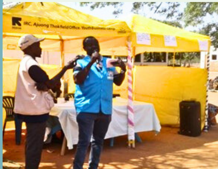
PHOTO: A Jamjang FM Community Correspondent at the Handwashing Day event.